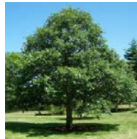
SWAMP WHITE OAK