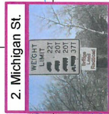
2. Michigan St.