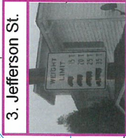
3. Jefferson St.